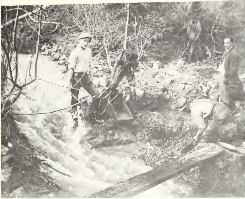
Figure 4. A group of Depression-era miners near the Applegate River, possible on Palmer Creek. Note the use of the early-style "rocker-box".

Depression mines occur in the same variety of location types as the "2" category. Four-fifths of the 25 inventoried sites are located within Standard CFL. Most of the remainder fall inside the Special class.